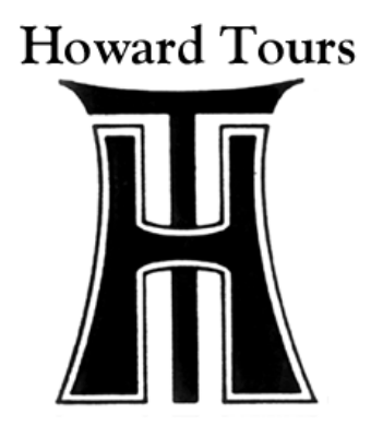
We look forward to traveling with you

In addition to providing tours to the International Conventions since 1950, Howard Tours has been an innovator in developing humanitarian travel programs that give Rotarians first hand experience in world understanding and peace. These include participation in National Immunization Days in Africa and India, the delivery of wheelchairs to those in need, humanitarian grant site visits and many other humanitarian travel programs.